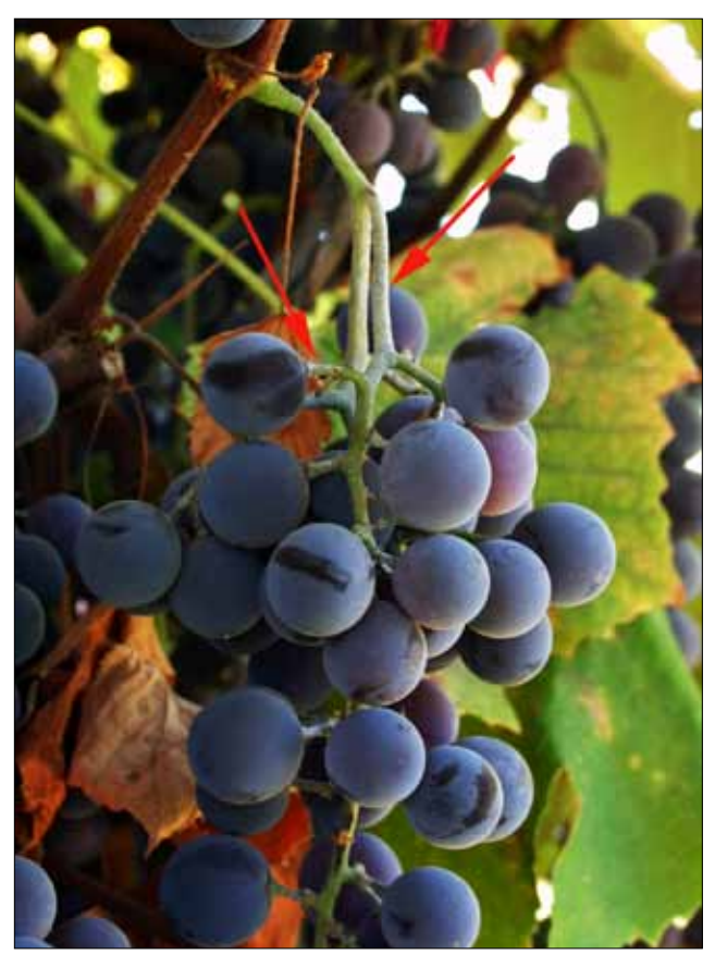
Figure 9. Powdery mildew develops somewhat differently on juice grapes (Vitis labruscana 'Concord') (pictured) and is rarely a problem in eastern Washington. The window of susceptibility is much shorter (prebloom to two weeks post bloom) for the individual berries, but the rachis can remain susceptible for most of the season. This usually results in later-season infections during high-pressure years, which can cause the rachis to become brittle and break as the berries accumulate weight near véraison.

Available fungicide options for both conventional and organic production are published annually in the 2012 Pest Management Guide for Grapes in Washington, Washington State University Publication EB0762 or in a more timely fashion on the Internet via the Washington State University Viticulture and Enology website at: http://wine.wsu.edu/researchextension. Contact your local Extension agent or Statewide Specialist for more information, or download the publication from the WSU Extension Publications website. A general list of available fungicides and fungicide groups is provided in Table 1; not all products are registered for use on all grape varieties. Check before using.