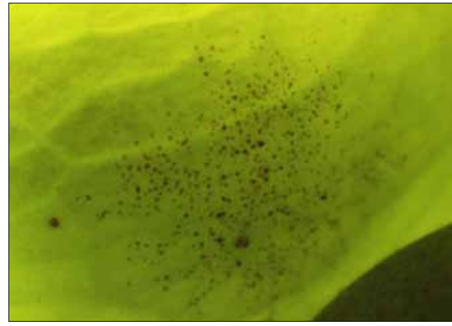
Figure 8. Infections that occur during the transition between susceptible and ontogenic resistance development often result in diffuse powdery mildew colonies, which often kill cells on the epidermis of the berry. These dead cells are prime locations for Botrytis cinerea infection and the introduction of other secondary spoilage microorganisms.

(especially nitrogen) as needed will provide a good foundation for disease management.