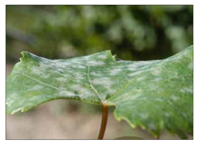
Figure 2. In severe cases, or shaded canopies, powdery mildew colonies can be found on the upper and lower leaf surfaces. On leaves exposed to the sun, colonies are likely to be found on the lower leaf surface only.

of the plant and, in severe cases, cause premature defoliation. Heavy, early-season infections can predispose buds and canes to winter injury by compromising tissue integrity.