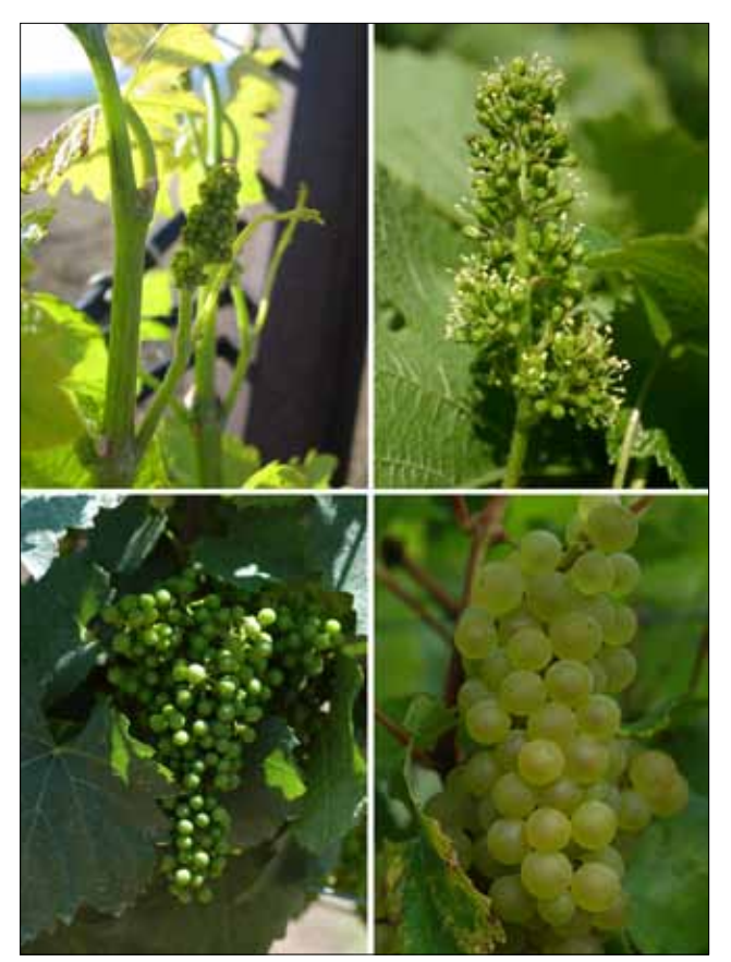
Figure 7. Grape tissue develops ontogenic (age-related) resistance to Erysiphe necator. Clusters are susceptible during elongation (top right) and bloom (top left) and then begin to develop resistance on to complete resistance from post-fruit set to véraison.

In juice grape production (V. labruscana 'Concord' and 'Niagara') in eastern Washington, PM is rarely a problem. Berries of V. labruscana juice grapes have a similar window of susceptibility as those of V. vinifera, although the window is shorter, and they become resistant by two weeks post bloom. Foliage of V. labruscana juice grapes is also more resistant than V. vinifera. This resistance ultimately reduces the amount of inoculum in the vinevard, thus reducing the incidence and severity of PM. The important exception in the development of PM on juice grapes is that the cluster rachis remains susceptible for a significantly longer period. Rachis infections can be a problem during cool, wet seasons and may result in premature berry loss near harvest as berries accumulate weight (Figure 9). Chemical intervention during bloom in highpressure years is still the best mode of control for