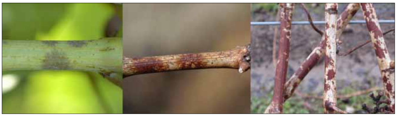
Figure 3. Shoots infected by powdery mildew exhibit classic, grey web-like scarring (left). From fall periderm formation (center) until spring (right), these infections are noticeable as brown to red web-like discolorations on the cane.