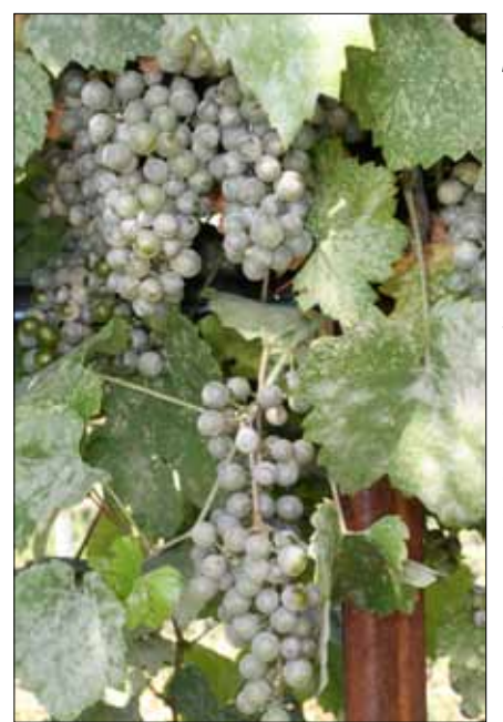
Figure 1. Severe powdery mildew infection on clusters can cause fruit cracking and arrested development (no sugar accumulation). Infections of this visible nature generally are not noticeable until just before véraison, even though infections likely occurred around bloom.

There are few plant diseases that have the same combination of international distribution and importance as grapevine powdery mildew (PM), which is present almost anywhere that susceptible grape varieties are grown. This disease, caused by the fungus Erysiphe necator, is believed to have originated in northeast North America, where the native grapevine species demonstrates a significant level of tolerance or resistance to this pathogen. However, the European wine grape species, Vitis vinifera, which did not evolve with this pathogen, is susceptible and severe symptoms can occur on fruit, foliage, and shoots of the plant when spread of the pathogen is extensive (Figures 1-3). Severe cluster infections render the fruit unusable, and even modest infections can predispose fruit to secondary invasion by spoilage microorganisms and Botrytis bunch rot (BBR). Foliar infections can significantly reduce the photosynthetic capacity