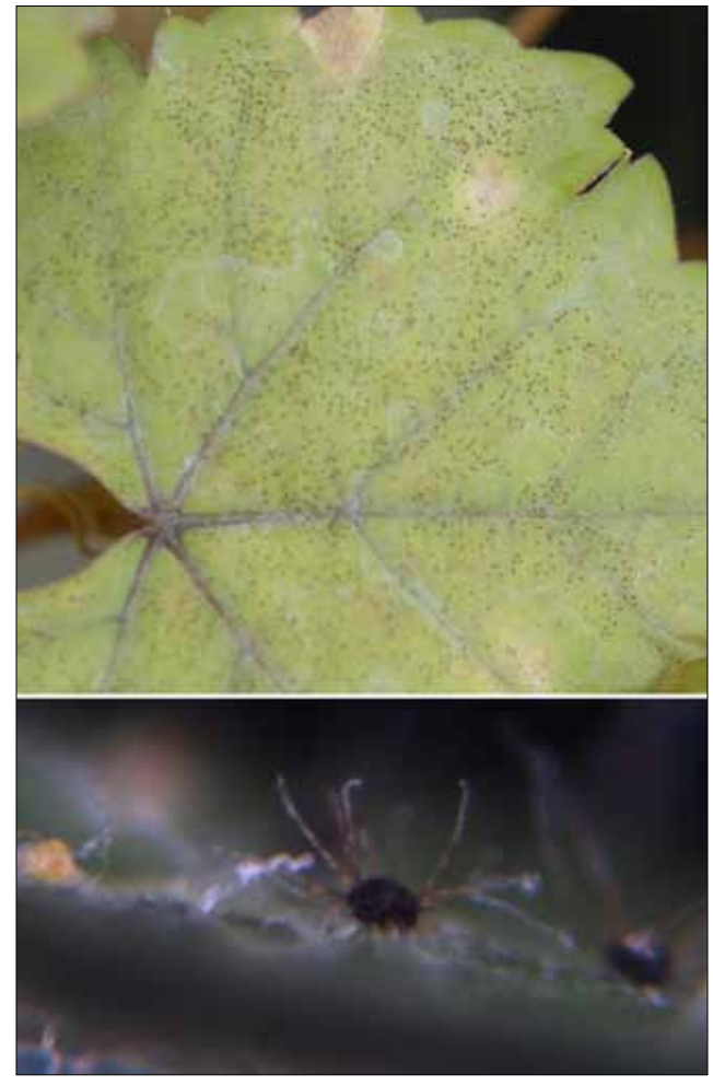
Figure 5. The main source of overwintered inoculum (ascospores) in cool and cold climates is cleistothecia. To the naked eye (or 10x magnification), cleistothecia look like small black specks on the upper and lower surfaces of leaves (top). Close up, one can readily see their appendages, which aid in anchoring the fungal body to bark when washed off foliage during fall rains (bottom).

Washington. Repeated wetting events from rain, heavy dew, prolonged dense fog, or over-the-canopy irrigation in the late winter/early spring of Year 2 weaken the outer walls of the chasmothecia, which causes them to split open and release the ascospores. Ascospores infect developing grape tissue when temperatures are at or above 50°F. A general rule of thumb for predicting potential ascospore infection events is: an infection event has occurred if there is 0.1 inch of rain (or overhead irrigation equivalent), and temperatures are above 50°F. Note, however, that this rule does not include heavy dew or prolonged dense fog, which can provide a sufficient wetting duration but cannot be as easily measured as precipitation. Ascospore infections appear as random colonies distributed throughout the vineyard, and they are largely confined to the lower surface of basal leaves.